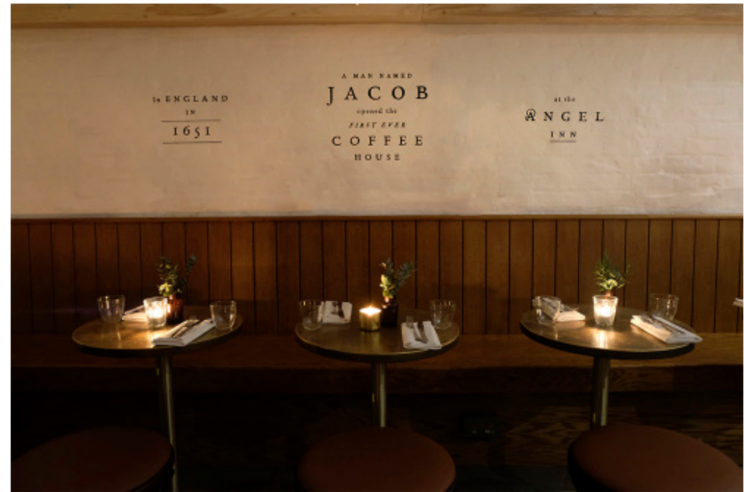
Fig 1.3 | Jacob the Angel Tables of two