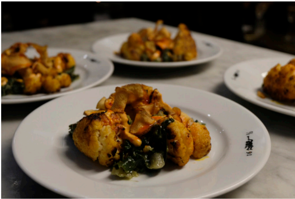
Fig 1.1 | Jacob the Angel Roasted Cauliflower Hamousta

By day, Jacob the Angel is an independent coffee house, and in equal parts eatery, bakery and take out too.