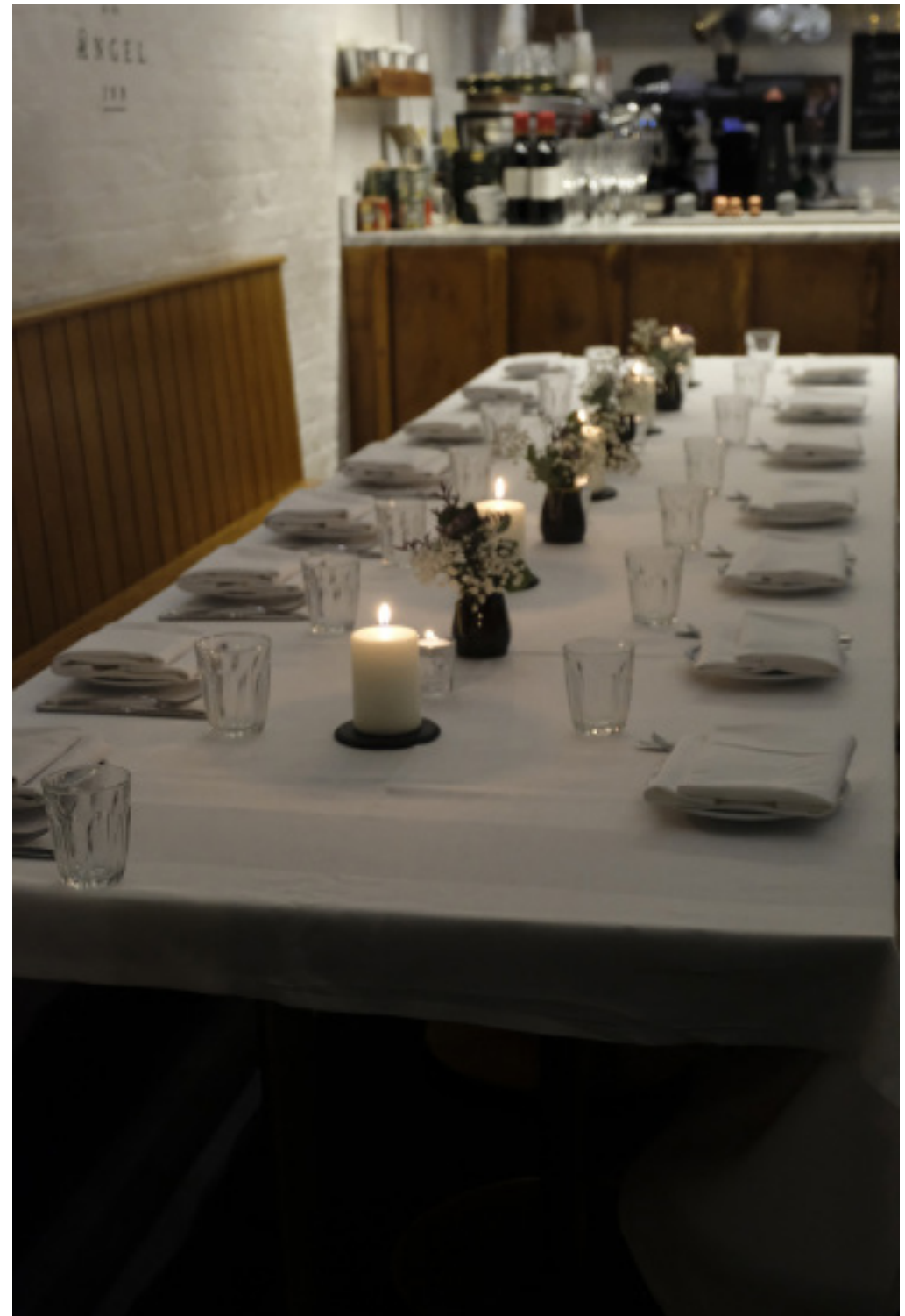
Fig 1.2 | Jacob the Angel Communal dining

The space is suitable for groups of up to 16 people. Guests have the option between a communal dining table or smaller tables of two.