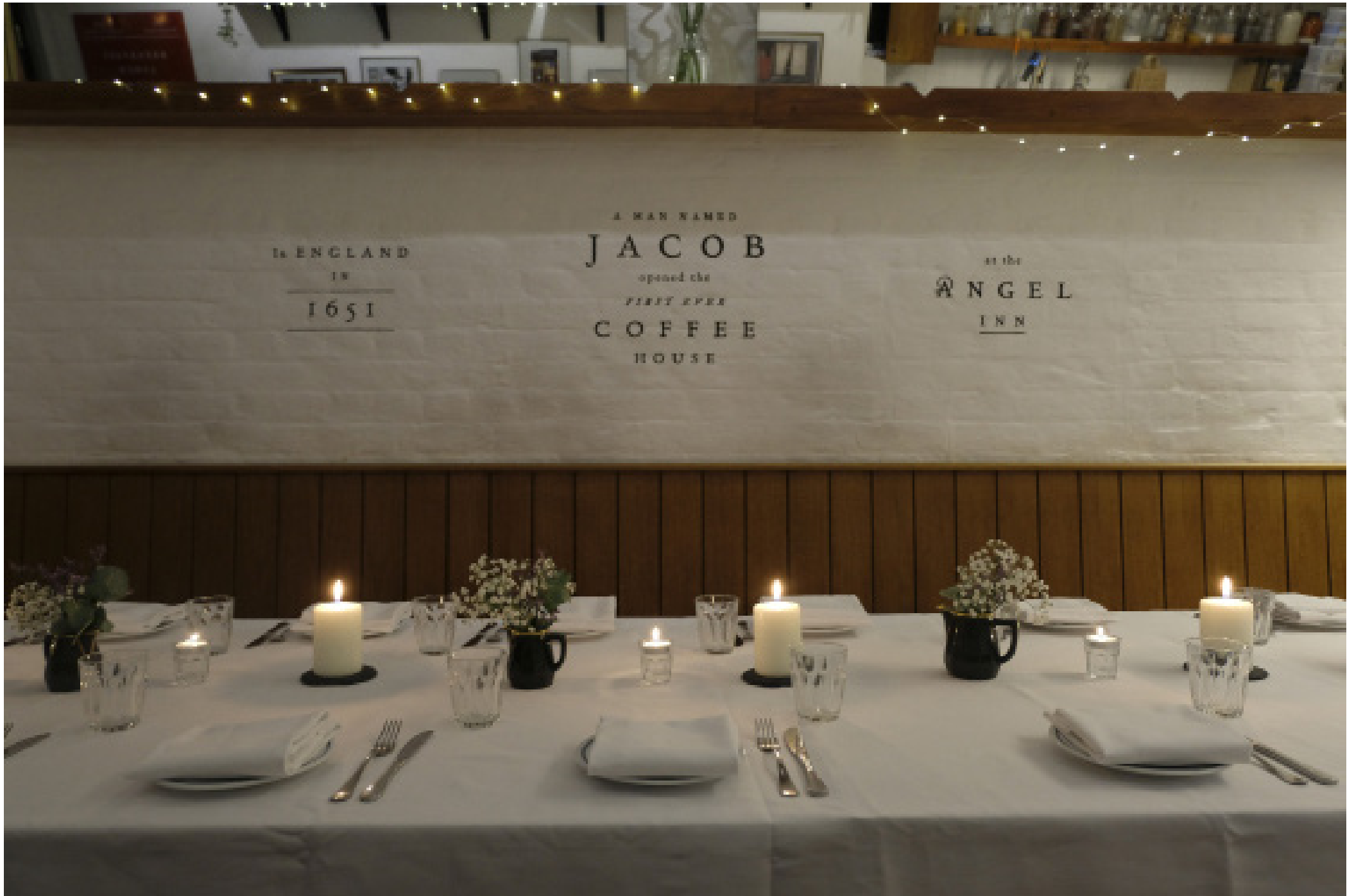
Fig 1.0 | Jacob the Angel Private party, capacity 16